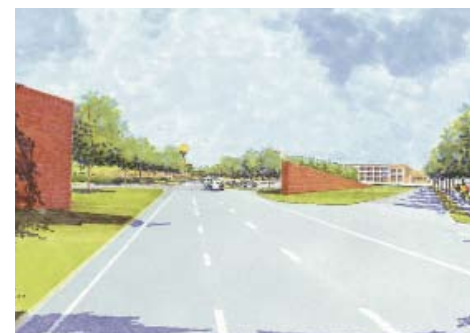
WRIGHT STATE UNIVERSITY